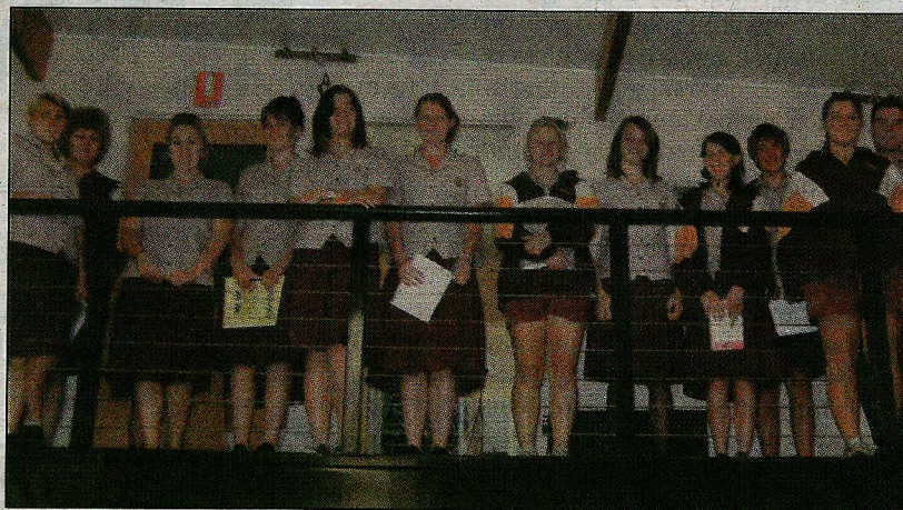
Year 11 students were looking to the future when they learnt about BMO's paperless direction which call for an emphasis on electronic filing and document management.